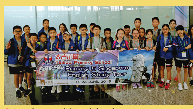
25 students joined the English study tour.

The Singapore English study tour held last summer was a great success. P.5 students benefited a lot as they had chances to explore and tour around Singapore's famous scenic spots. Students were required to accomplish different tasks, like interviewing native speakers. These provided students the opportunity to study English through authentic learning.