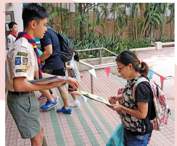
○ 當天各位童軍, 努力為學校服務。