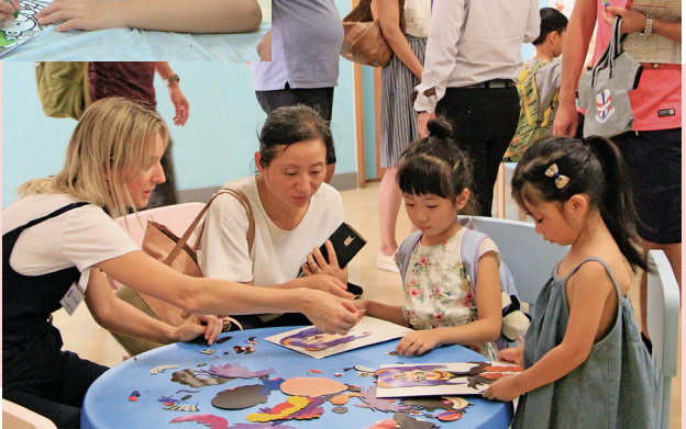
○ 在外籍老師的帶領下 玩拼圖遊戲。