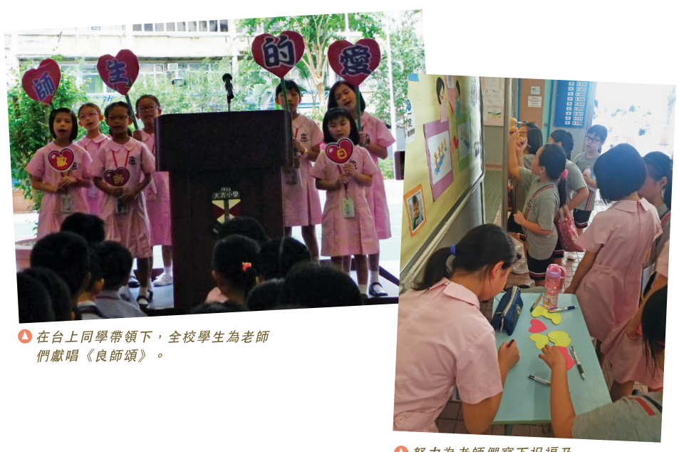
△ 努力為老師們寫下祝福及 感謝之言。

謝老師的關愛和教導。同學們更踴躍地在敬師壁報板上留言及簽名,藉此向老師表達由衷感激之心。