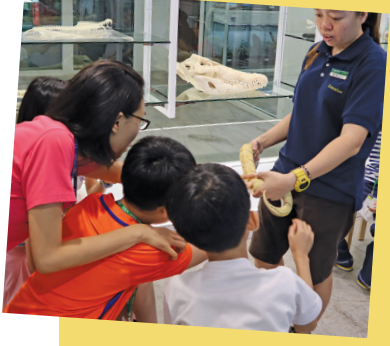
Students joined the behindthe-scenes workshop at the Singapore Zoo and they got a chance to touch a snake.

Students visited Little India and learnt